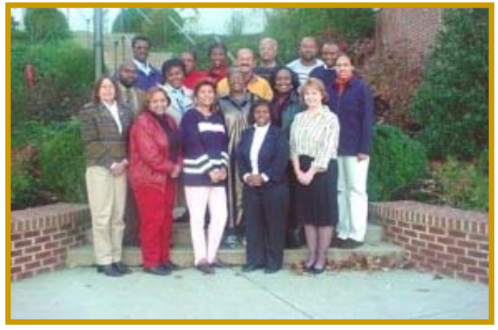
TSU Extension State Staff